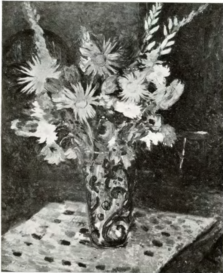
FLOWERS IN A VASE (24 x 20), J. B. Manson, N.E.A.C.