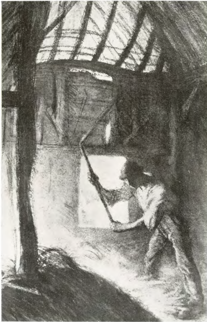
THRESHING IN A BARN, BY THE FLAIL (9 X 14), Sir George Clausen , R.A., R.P., R.A.W.S.