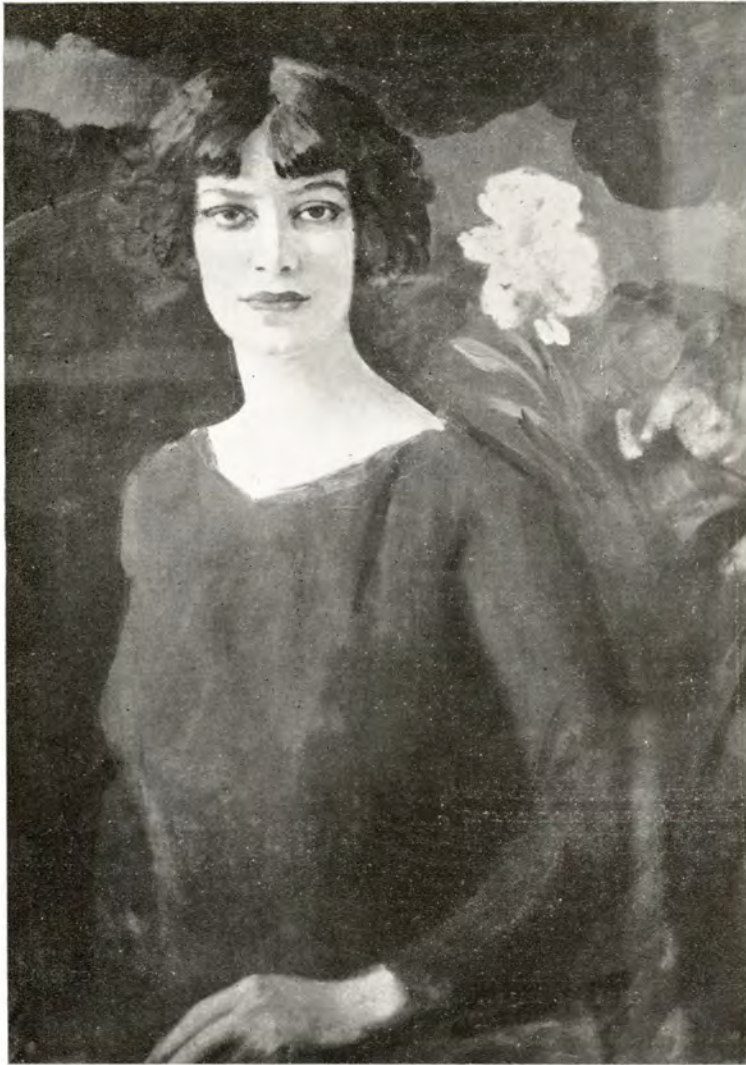
LA DUCHESSE DE GRAMMONT (36 x 25), Augustus John , R.A., R.P., N.E.A.C.