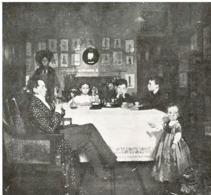
A BLOOMSBURY FAMILY (36 x 33), Sir William Orpen, R.A., R.H.A., R.P., N.E.A.C.