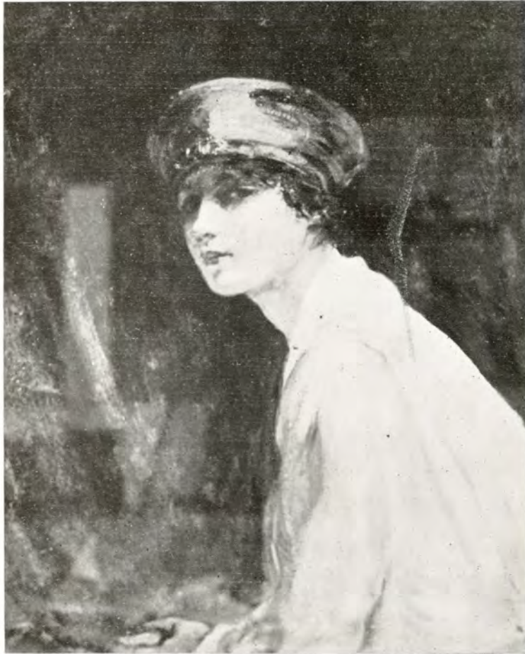
THE GREEN HAT (24 x 30), Ambrose McEvoy , A.R.A., N.E.A.C., R.P.