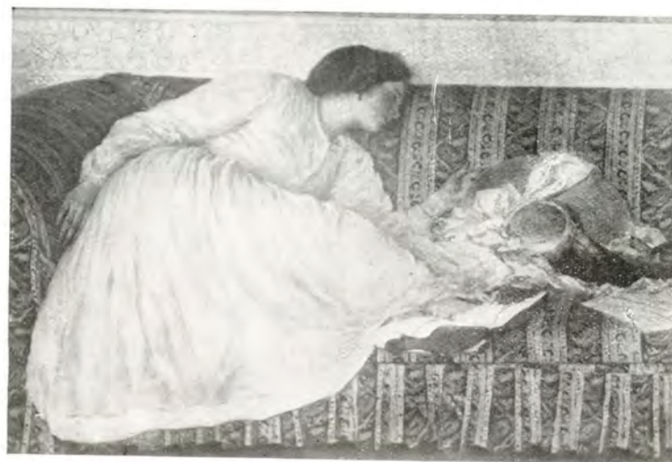
THE MUSLIN DRESS (55 x 39), P. Wilson Steer, O.M., N.E.A.C.