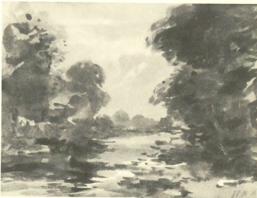
No. 8 "THE BACK WATER"