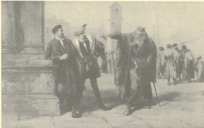
No. 45 "SHYLOCK, SALANIO AND SALARINO"