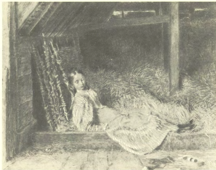
No. 49 "SLUMBER"