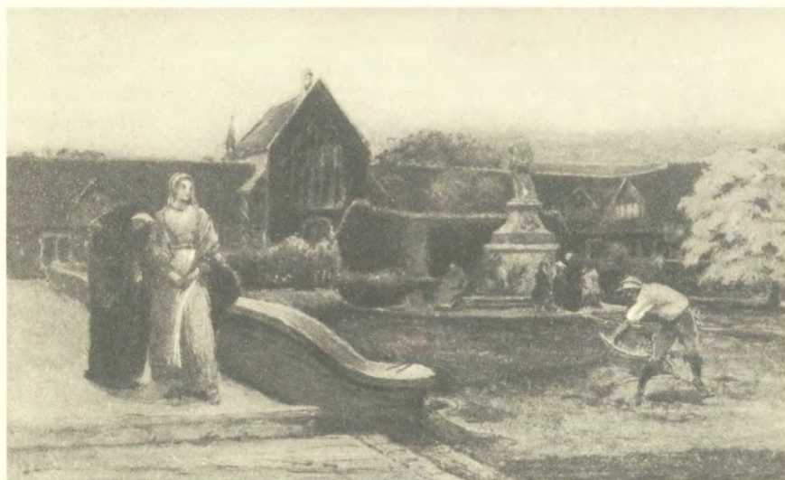
No. 100 "STUDY FOR THE HARBOUR OF REFUGE"