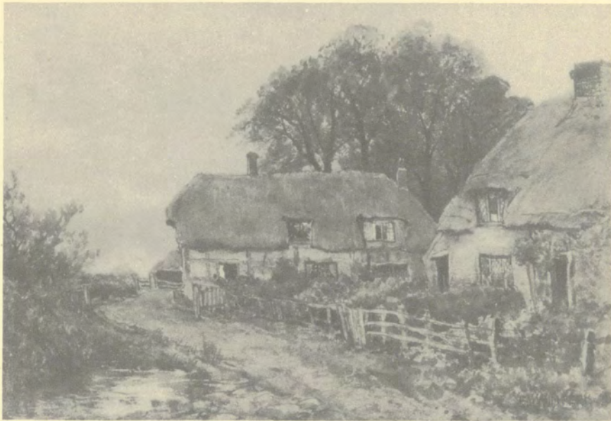
No. 104 "COTTAGES NEAR RINGWOOD"