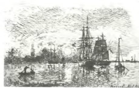
106. Johan Barthold Jongkind Soleil Couchant—Part d'Anvers (1868) etching