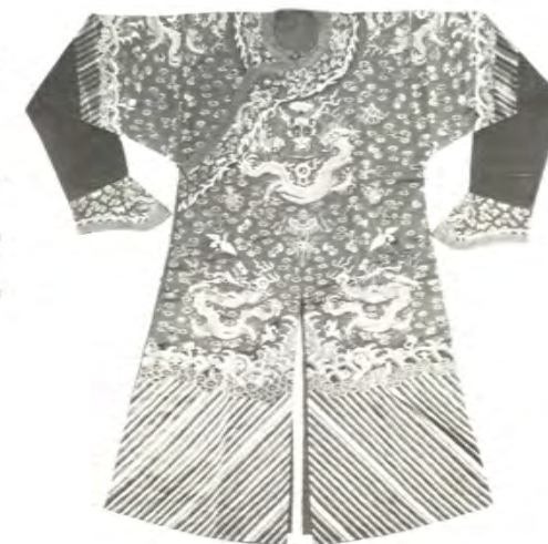
32. Chinese Imperial Robe (Manchu, Ching Dynasty) Embroidered silk