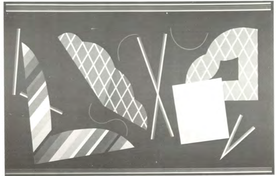
71. Alun Leach-Jones Mediterranean (1979) acrylic on canvas