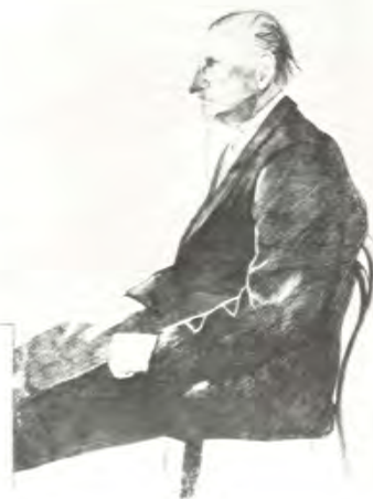
16 David Hockney The Print Collector (1970-71) lithograph