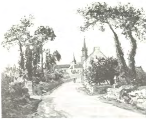
52. Maxime Emile Louis Maufra La Route du Couroy, Ploermel, Morbihan (1915) oil on canvas